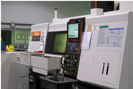
Mazak Integrex 100IV-ST