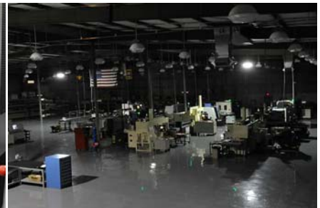
Lights Out Manufacturing