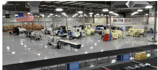
View of Machine Shop Area

Ruelco also features a full support staff of engineers, machinists, and quality control personnel that are always available to answer your questions and ensure the quality of your parts.