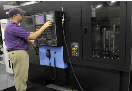
Doosan Lynx 220GL